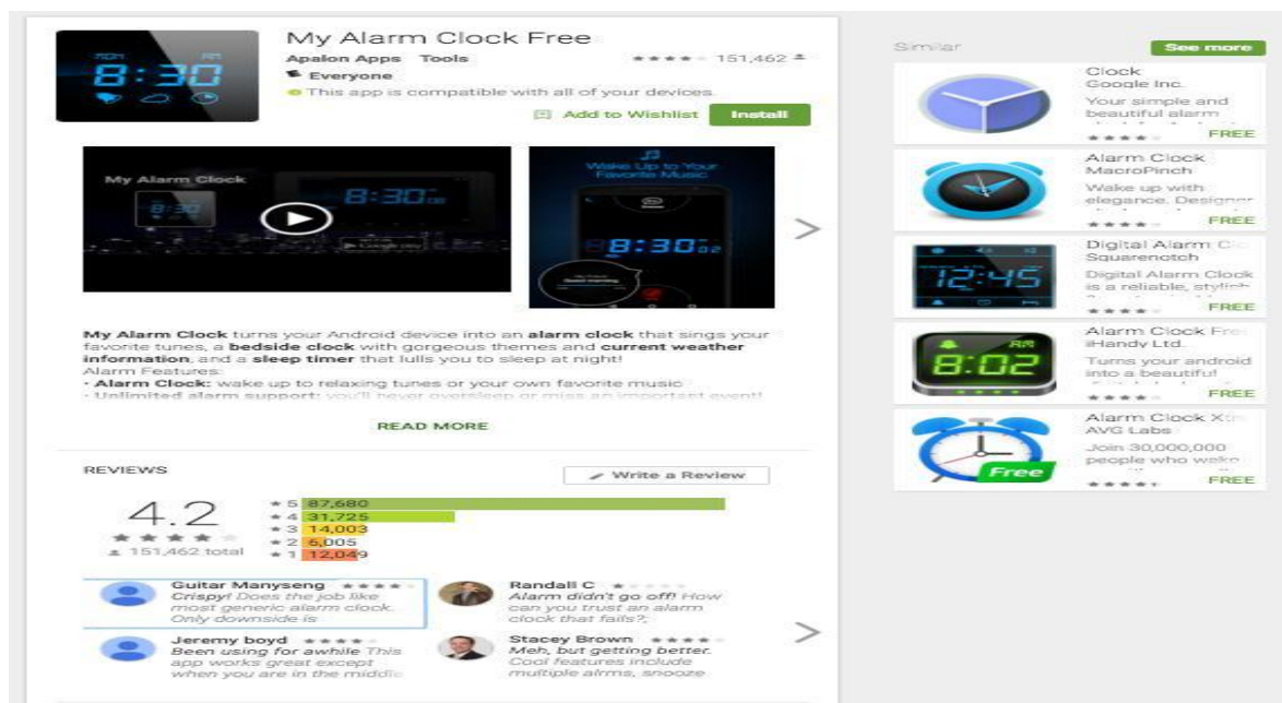
Fig. 3: Snapshot of an app in the app market.

Additionally, these numeric ratings also provided researchers with a clear way of knowing if an app is good or not and if the review by a user is overall of a complimentary or derogatory nature.