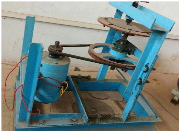
Figure 4: Pin on disc wear test machine.

A pin-on-disc test apparatus was used to investigate the dry sliding wear characteristics of the composites as per ASTM G99-95 standards. This test method describes a laboratory procedure for determining the wear of materials during sliding using a pin-on-disc apparatus. This equipment works on the dc supply.