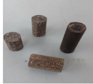
Figure 3: Composite pins.