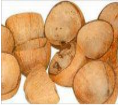
Figure 1: Coconut shells.

development of new composites because of their high strength and modulus properties. Approximate value of coconut shell density is 1.60 g/cm 3 .