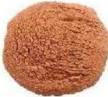
Figure 2: CSP.