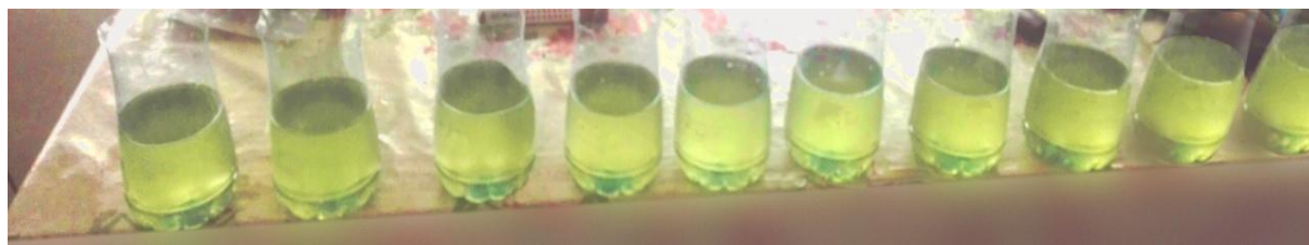
Figure 1: Containers of chlorella and salt water.

Ten containers were used in this experiment. In each container, 40 ml of Chlorella vulgaris solution and 2 ml of UST media were mixed. The nutrients (UST) were added to allow the algae to survive in the high salt mixtures. 400 ml solutions of different salinities were prepared and added to each container to simulate different kinds of salt water starting from 38 ppt (parts per thousand) which represents sea water, going through 20 ppt as in brackish waters and ending with 5 ppt similar to that in low salt water. All salinities used are given in table 1 as total dissolved salts (TDS) in ppt.