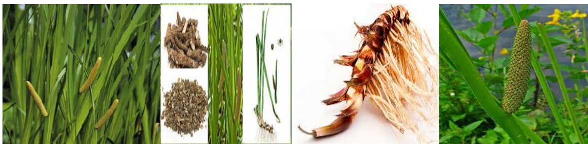
Figure 1: The surface and roots of the plant Acorus calamus L .

Acorus calamus L is a perennial herbaceous plant with 1.5 m long, horizontal, reptile, branched and multicellular, with dark brown or greenish-yellow color. At the top of the rhizome is a collection of leaves. Leaves are linear or sword-like, 60-120 cm long, with straight edges and parallel veins (typical of single-stage plants). The stem (flower arrow) is green, upright, not branched, triangular, leafless, on one side, with sharp edges. At the stem there are two sexy, yellow flowers that are collected on the stem. The cone is cylindrical-cone-like, 4-12 cm long. Flower bouquet - a 50 cm long leaf-shaped leaf is visible from the stalk. The flowerpot is modest, simple, six-leafed, six-parent, three-room maternity knot. The fruit is elongated with many seeds and with a damp red fruit. The roots and leaves are odorless, the tiny roots are odorless. It blooms from late May to July. Land surface of Acorus calamus L Fig. 1. [1-4]