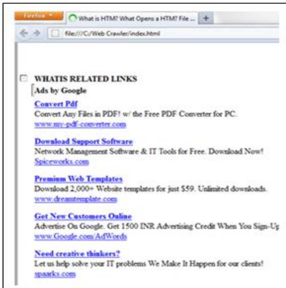
Figure 4: The output of the crawler is given below.

The architecture model is proposed for two stage crawling the pages with higher rank. The representative set of domains show the effectiveness of the proposed two-stage crawler. This achieves higher harvest rates than other crawlers. In future work, we plan to combine pre-query and post-query approaches for classifying deep-web forms to further improve the accuracy of the form classifier. The requirements for external interface design are windows operating system, IDE Netbeans, Java and MySQL.