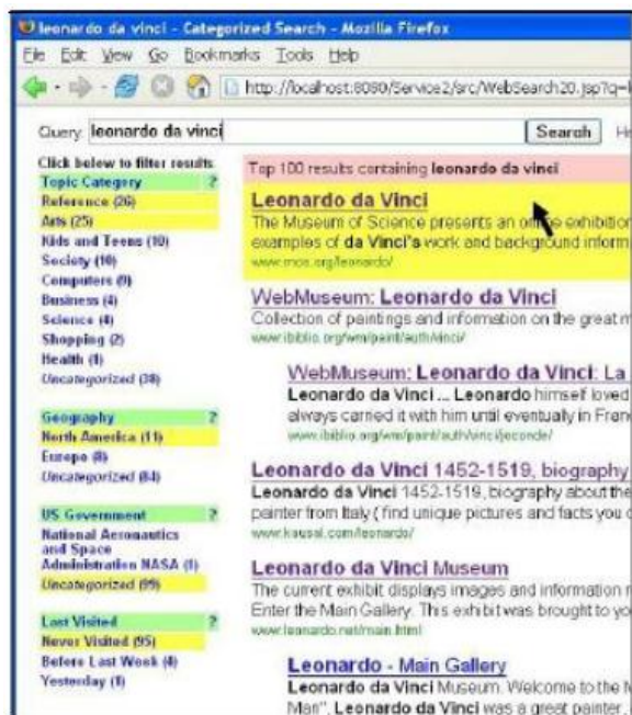
Figure 2. The SERVICE web search prototype uses fast-feature techniques to categorize search results and generate interactive overviews based on meaningful and stable categories. This detail shows that the top result is categorized by topic (Reference and Arts) and geographic region (North America), and it has never been visited by this searcher.