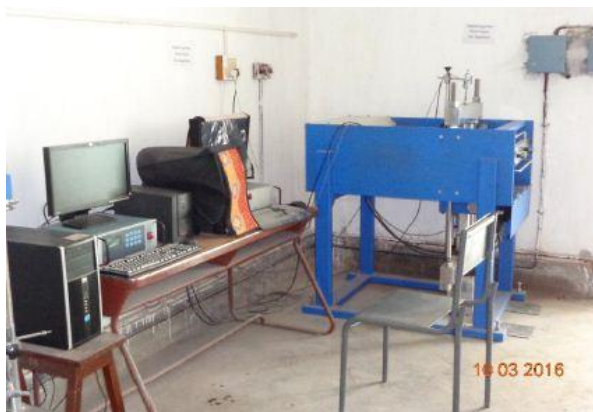
Figure 3: Large Box Shear Test Arrangement.