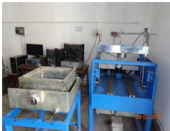
Figure 2: Large Box Shear Test Arrangement.