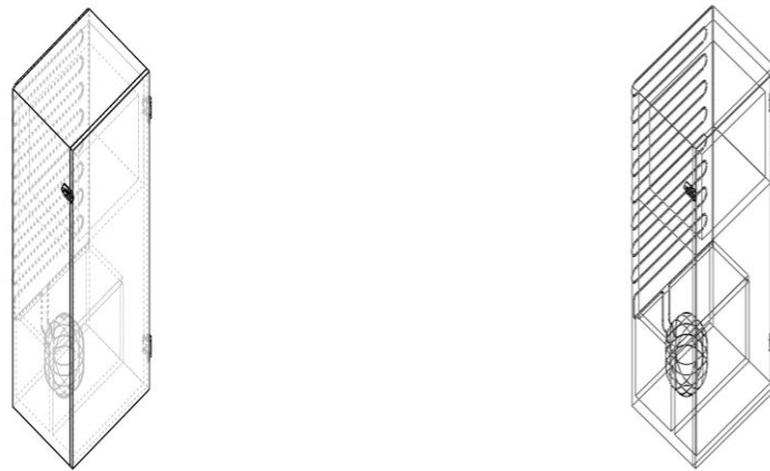
Fig. 1: The Views of Wooden Refrigerator.

In a refrigeration system, liquid refrigerant absorbs heat from the air when changing to a gas (boiling). Water boils at 100°C and cannot be used to cool when it changes from a liquid to a gas. Refrigerant gas should boil at a low temperature. R134a boils at -26°C and freezes at -101°C. Hydrocarbons like, Propane (R190), Butane (R600), Iso-butane (R600a), Propylene (R1270) etc. are generally used as refrigerant in refrigeration system because of their similar properties with R12 and R134a with its very low Global Warming Potential and zero Ozone Depletion Potential. The vapor compression refrigeration cycle is a common method for transferring heat from a low temperature to a high temperature. The figure 2. below show the principles of operation of a refrigeration cycle. Coefficient of performance (COP) of the refrigerator is defined as desired output per required input.