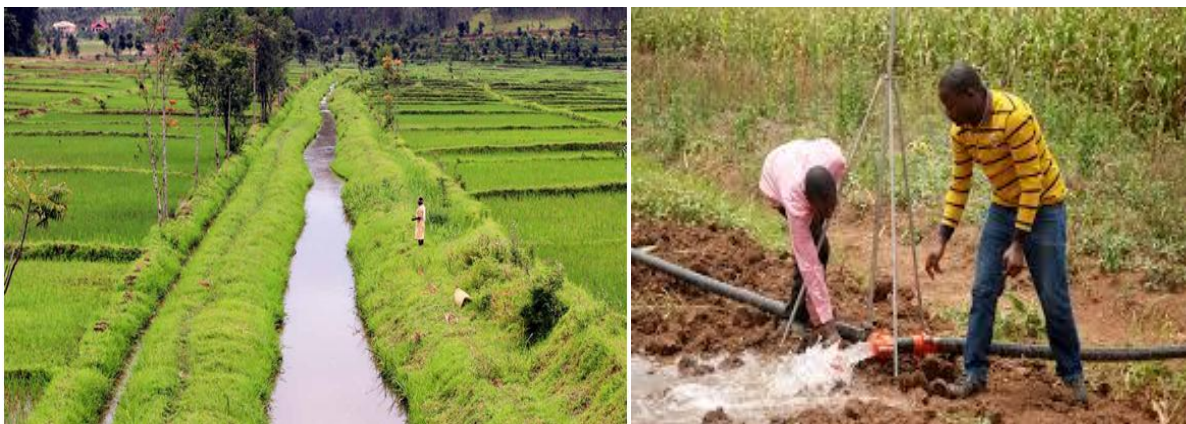
Figure: Kabilizi River supporting the water balance Figure: Proposed water conveyance (pipeline).

The rice farmers/growers of COOPRIKI-CYUNUZI practice two overlapping seasons (A&B) per year for efficiency use of water through main grown crop of paddy rice and vegetables in season C.(Kopparthi, 2016).