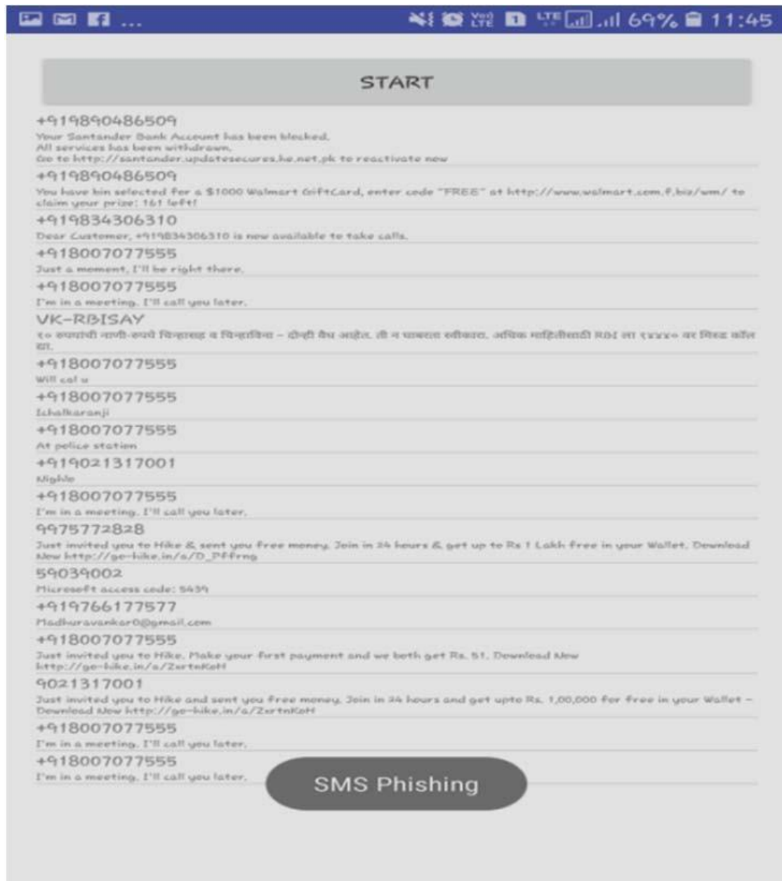
Fig. 3: List of Input message dataset.

The Bayesian Classification represents a supervised learning method as well as a statistical method for classification. It provides practical learning algorithms and prior knowledge and observed data can be combined. It also provides a useful perspective.