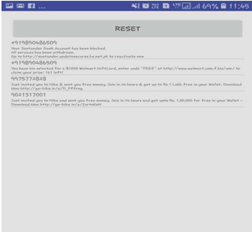
Fig. 4: List of phishing messages.

result of smishing. Fig 4 shows all the messages which are phishing messages. User gets warning about not providing any credentials to the suspicious links and mobile numbers present in these phishing messages.