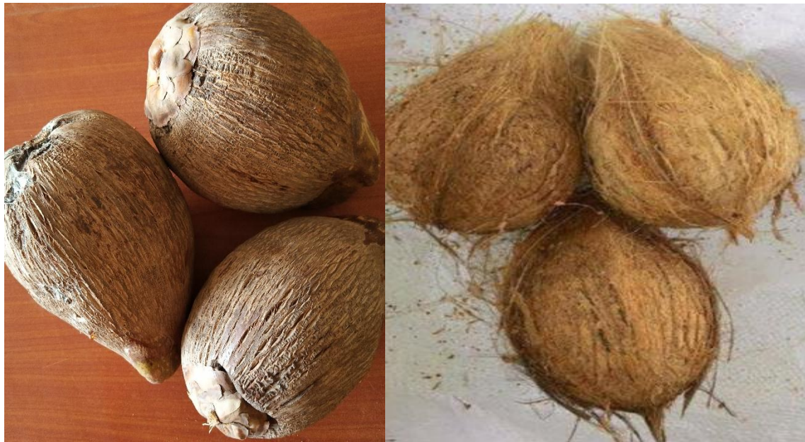
Figure 5: Pictorial view of before and after dehusking of coconut fruit.