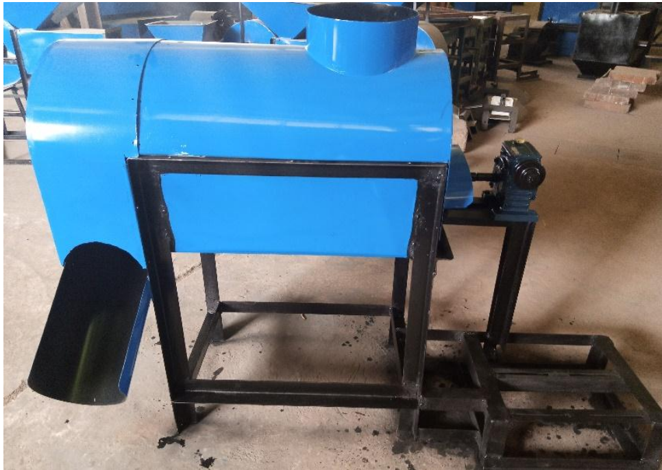
Figure 2: Pictorial View of the NCAM Coconut Dehusking Machine.

outer \varnothing 148 . It is best use to transmit rotary motion between shafts that rotate in opposite direction.