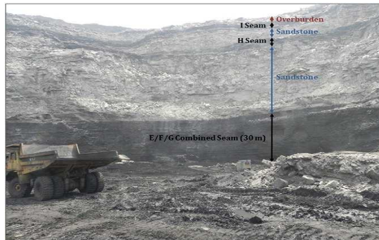
Figure 1: Block 4 Quarry Edge.

design and easy linking together of the various programs. Apart from the price of consumables and stores, the trend of prices of HEMM is increasing. Figure-1 shows the quarry cross-section of a mine.