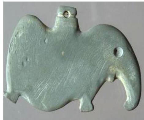
Fig. 2: 100 mm Palette from Naqada I/II. [17]