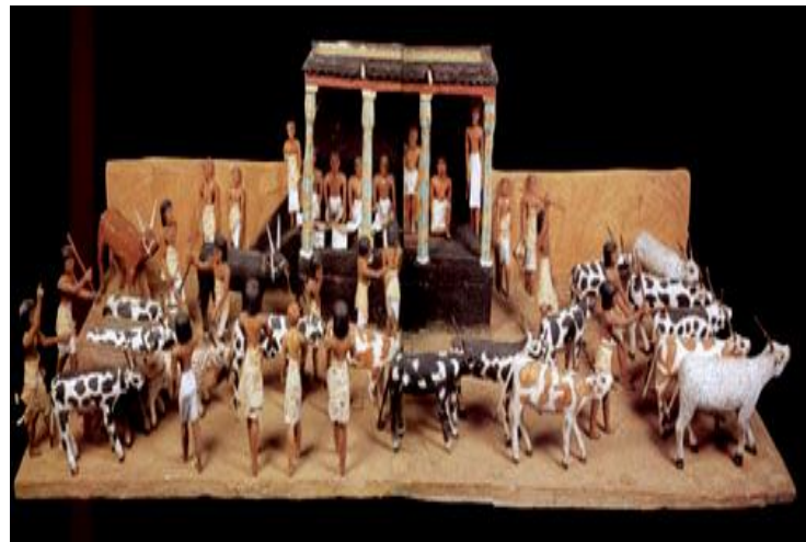
Fig.6: Palette of King Narmer of the 1 st Dynasty. [22] Fig.7: Cattle model from the 11 th Dynasty. [23]