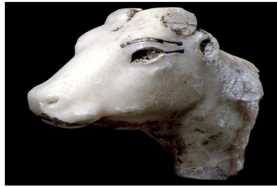
Fig. 11: Calcite cow head from the 18 th Dynasty. [27]