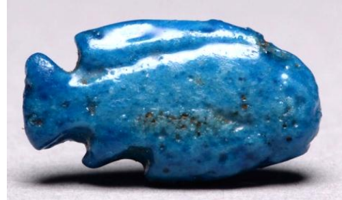
Fig. 28: Fish-amulet from the NK / 3 rd IP. [49]