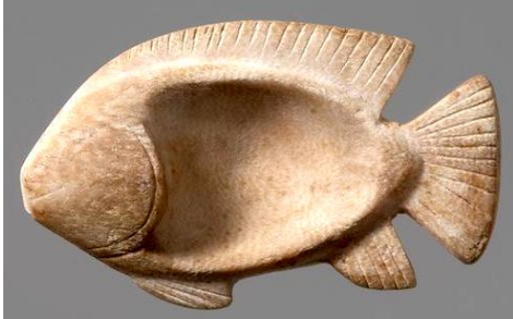
Fig. 27: Fish-spoon from the New Kingdom. [48]