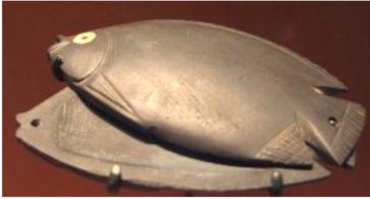
Fig. 17: Fish-dish from Naqada III / 1 st Dynasty. [37]