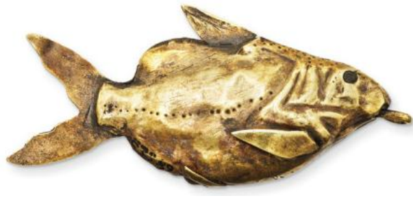
Fig. 18: Fish-amulet from the 12 th Dynasty. [38]