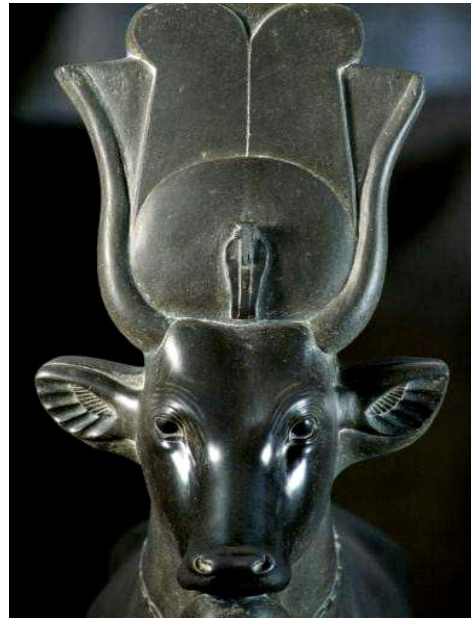
Fig. 15: Cow statue from the 26 th Dynasty. [32]

This is a very delicate complete statue for the Hathor cow carved from schist and professionally polished to give the very shining surface shown in Fig.15 with a very complex details for the face including a disk-feather-cobra crown between the long-curved-horns of the cow.