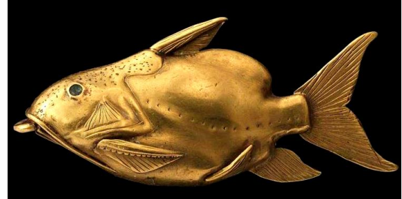
Fig. 21: Fish-amulet from the 12 th -13 th Dynasties. [41] Fig. 22: Fish-amulet from the 11 th -14 th Dynasties. [42]