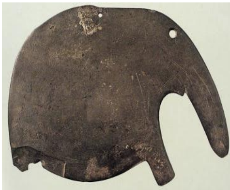
Fig. 1: 139.7 mm Palette from Naqada I/II. [16]