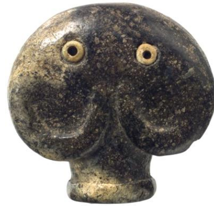
Fig. 3: Ivory amulet from Naqada I/II. [16] Fig. 4: Serpentine amulet from Naqada II. [18]