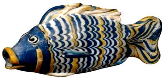
Fig. 25: Glass fish-bottle from the 18 th Dynasty. [45]