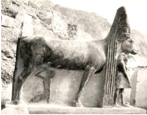
Fig. 10: Hathor chapel from the 18 th Dynasty. [26]