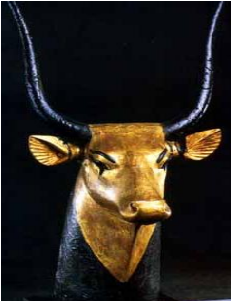
Fig. 14: Cow head from Tut's tomb. [31]