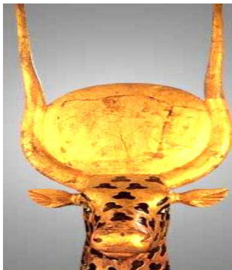
Fig. 13: b Face of the sacred cow of Tut's funerary bed. [30]