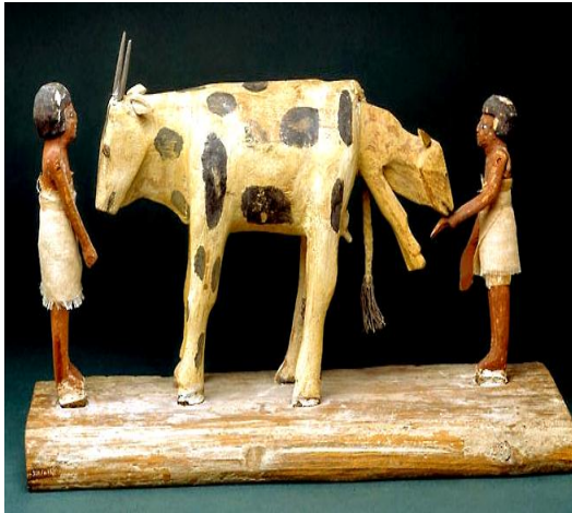
Fig. 8: Birthing cow from the 11 th Dynasty. [24]