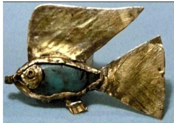
Fig. 20: Gold-fish-amulet from the 12 th Dynasty. [40]