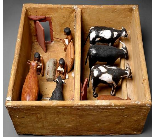
Fig. 9: Cattle stable from the 12 th Dynasty. [25]