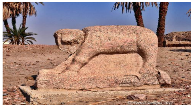
Fig. 5: Granite elephant statue from Aswan. [19]