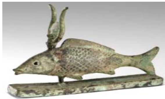
Fig. 29: Fish-statue from the 26 th Dynasty. [50]