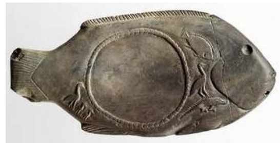
Fig. 17: Fish-dish from Naqada III. [36]