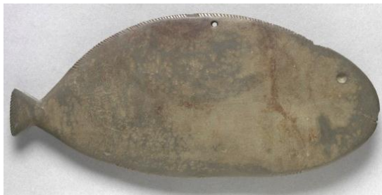
Fig. 16: Fish-Palette from Naqada II/1 st Dynasty. [35]