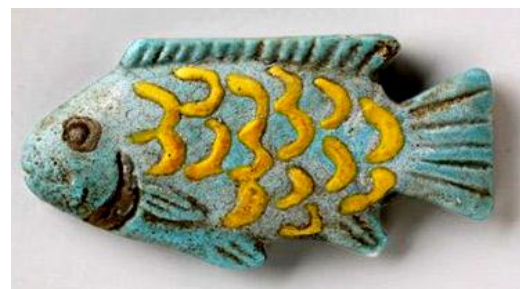
Fig. 23: Wood fish from the 17 th Dynasty [43] .