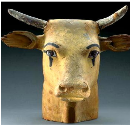
Fig. 12: Wooden cow head from the 18 th Dynasty. [28]