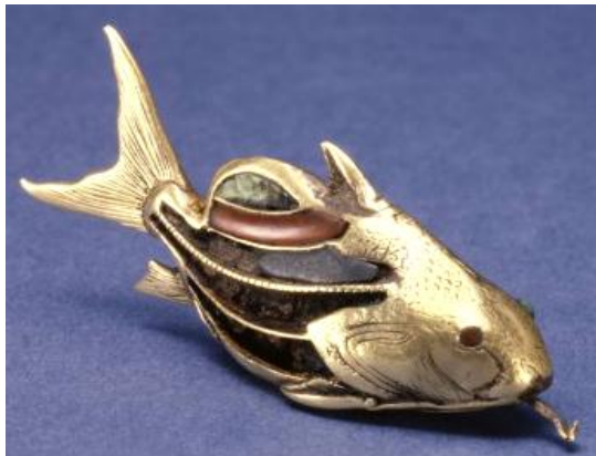
Fig. 19: Gold-fish-amulet from the 12 th Dynasty. [39]