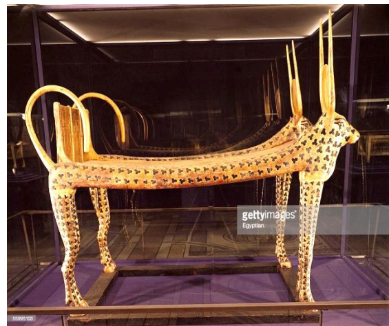
Fig. 13: A Sacred cow-bed from the 18 th Dynasty. [29]