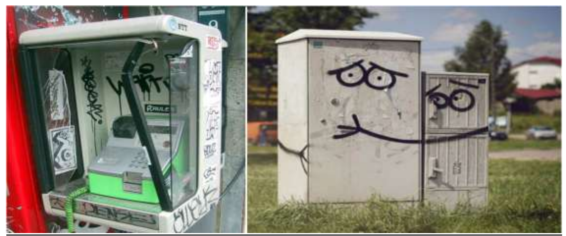
Fig. 2: Examples of vandalism.<sup>[12,13]</sup>

This kind of vandalism is a conscious tactic that is applied for a certain purpose. This type of demolition can take many different views, such as writing on walls or breaking the windows.<sup>[9]</sup>