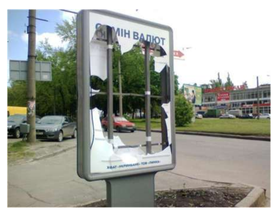
Fig. 1: Example of vandalism on a billboard.<sup>[11]</sup>

board, hurting the telephone booths etc., are some of the most common examples of vandalism.<sup>[1]</sup>