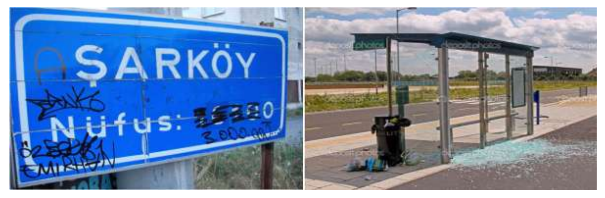
Fig. 3: Examples of vandalism.<sup>[14,15]</sup>

Pouring acid on cars, removing flowers, cutting car tires in a car park, throwing stones at railways, making public toilets not used, etc. some of these examples of vandalism. In this kind of vandalism, the person takes tremendous pleasure because of his behavior.<sup>[9]</sup>