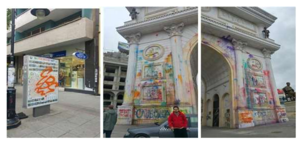
Fig. 4: Examples of vandalism from Skopje, Macedonia (Original, 2018).

Among the causes of vandalism are personal characteristics, physical and social environment characteristics, friend environment, non-ownership, belonging, educational status, economic situation. Research shown that personal characteristics can cause vandalistic behavior. Ward (1973) and Dunning (1987) found that a large proportion of those involved in such incidents were younger persons who did not have a certain skill.<sup>[9]</sup> Dinçtürk (2007) mentioned that factors such as lack of ownership, population density, lack of education and intensive use can be counted among the causes of vandalism.<sup>[6]</sup>