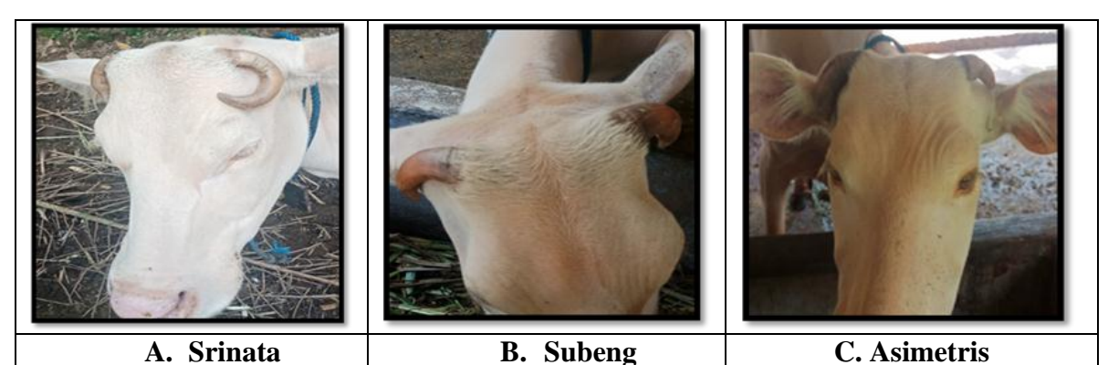
Fig 2: The differences of horn types: Srinata (A), Subeng (B), and Asimetris (C) in 23 male and 21 female Taro white cattle conserved in Taro Village in 2020.

Beside all the horn type and orientation mentioned above, this study revealed other horn type and horn orientation that had never been reported found in Bali cattle (Fig. 2). Its warp orientation is similar to the jewellery that commonly used on the Balinese bride's forehead, so Balinese named its orientation as srinata. Another orientation looks alike subeng (Balinese dancers' earrings) and named its orientation as subeng. Another else orientation looks alike