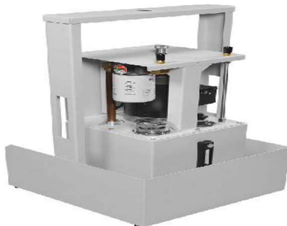
Figure 4: Power Unit 6310-00 used on hydraulic panel.

The Power used on hydraulic panel Unit consists of an electric drive motor coupled to a fixed displacement gear-type hydraulic pump, an oil reservoir, and an oil filter with pressure drop indicator. A built-in pressure relief valve limits the maximum pump outlet pressure to 6200 kPa (900 psi). The Power Unit is provided with a lifting frame that allows the Power Unit to be raised and lowered hydraulically, using either of the Cylinders, Models 6340 and 6341. [Electro hydraulics work book basic level by McGraw Hill, 1998 4 th edition.]