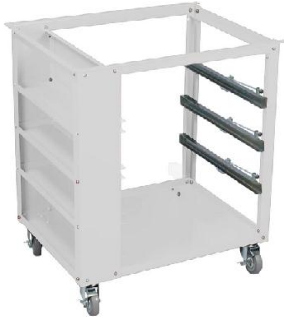
Figure 2: Unassembled Frame.