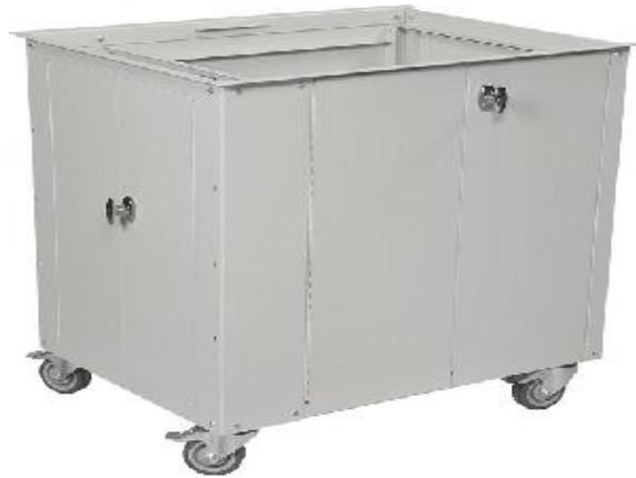
Figure 3: Bench (with Dressing Panels and Lockable Front Door, Assembled) Specifications.

[HYDROMODEL-200 Transparent Hydraulics - Electro-hydraulics by K Subramanya, 2000, 5 th Edition]