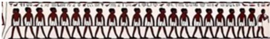
Fig. 5: Haulers team in the second row.