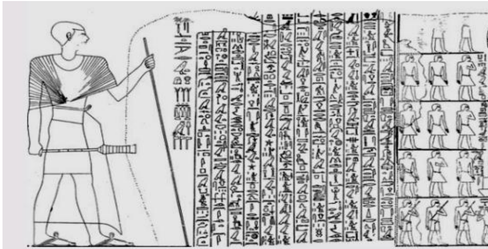
Fig. 2: Master supervision of the transportation of the Djehutihotep statue. [6]