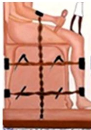
Fig.3: Statue lashing to sledge.