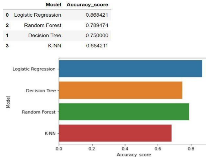
Figure 3: Accuracy-score.

prediction techniques. In which the KNeighbor has the 68.42% of accuracy-score which is less and found to be error in prediction. Decision Tree has the accuracy of 75% which is way better then K-Neighbor and the Random forest has the accuracy-score of 78.94% which is as near as result of Logistic Regression which has accuracy-score of 86.84%.