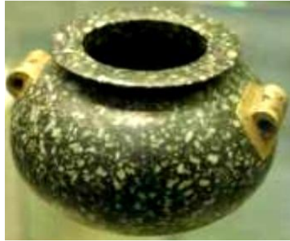
Figure 5: Porphyry jar from the 2 nd Dynasty. [19,20]

The second example is a perfume alabaster jar for Akhenaten, the 10 th Pharaoh the 18 th Dynasty (1351-1334 BC) in display in the Metropolitan Museum of Art and shown in Fig.6 [01,22] This jar has the features: