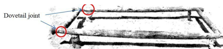
Figure1: Bed frame from the 1 st Dynasty [12] .

The ancient Egyptians could establish well authorized and organized furniture industry since the time of the 1 st Dynasty. [10] They used adhesives to strengthen their wooden joints between furniture elements as will be investigated in the following examples: