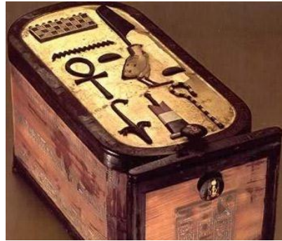
Figure 3: Wooden jewelry box from the 18 th Dynasty. [16]