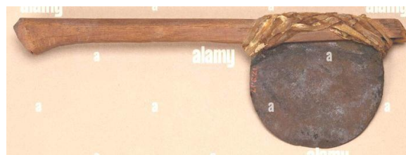
Figure 8: Axe from 12 th Dynasty. [26]

The second example is an axe from the 12 th Dynasty (1802-1762 BC) with copper blade and wooden handle shown in Fig.8. [27] This axe has the features: