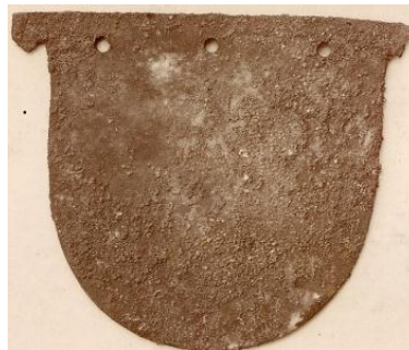
Figure 7: Axe head from 9-12 th Dynasties. [26]

The second example is an axe from the 12 th Dynasty (1802-1762 BC) with copper blade and wooden handle shown in Fig.8. [27] This axe has the features: