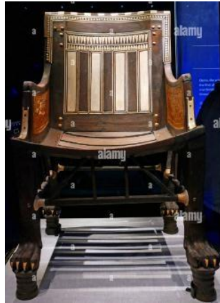
Figure 4: Ebony chair from the 18 th Dynasty. [18]