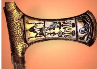
Figure 10: Ceremonial axe from the 18 th Dynasty. [29]