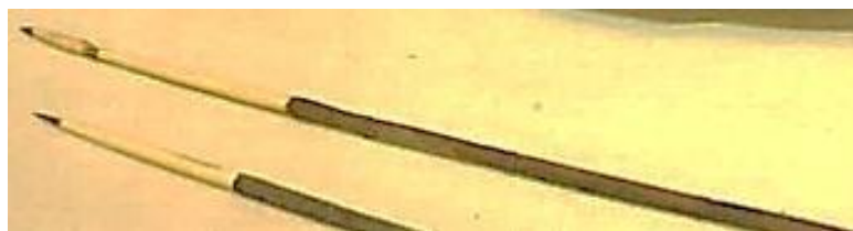
Figure 11: Arrows from Naqada III. [31]

The second example is arrows from the 12 th Dynasty (1991-1802 BC) in display in the British Museum, London and shown in Fig.12. [32] These arrows have the features: