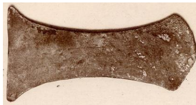
Figure 9: Axe head from 14 th – 17 th Dynasties. [28]

The fourth example is a ceremonial axe belonged to Ahmose I, 1 st Pharaoh and founder of the 18 th Dynasty (1549-1524 BC) in display in the Metropolitan Museum of Art and shown in Fig.10. [23] This axe has the features: