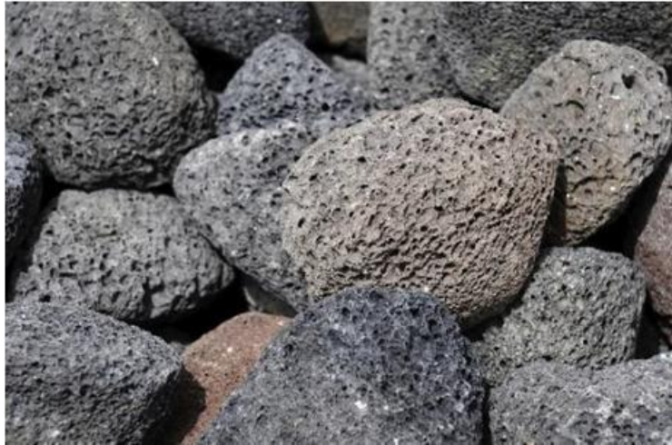
Fig. 3.2.2.C Pumice Stone.