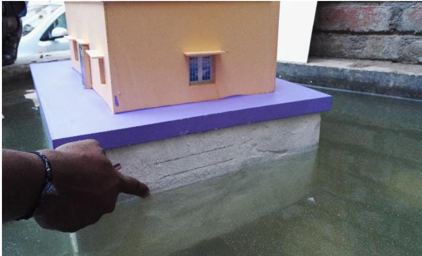
Fig: 8.5.2 Floating structure.

In the above figure 8.5.2 the three lines shows the distance from the bottom that is 20cm, 22.5cm & 25cm respectively. Hence the structure sinks according to the designed and calculated depth.