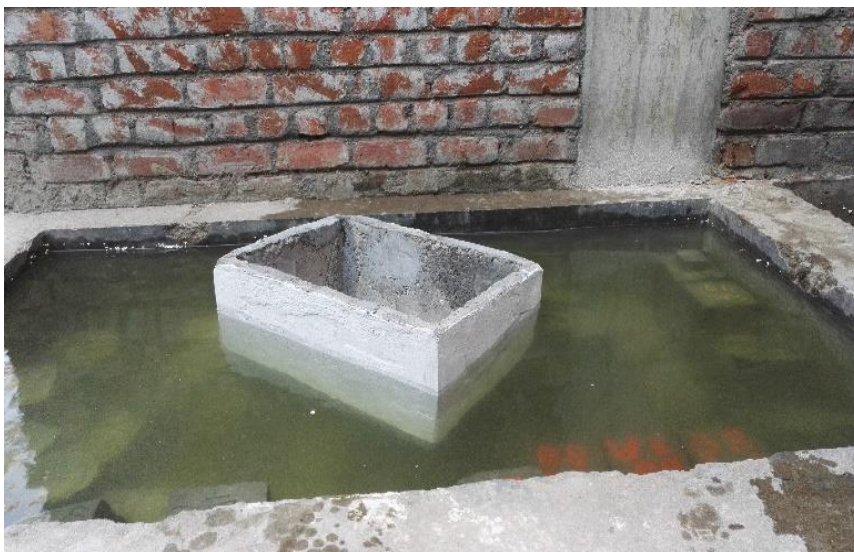
Fig: 8.5.1 Floating structure.