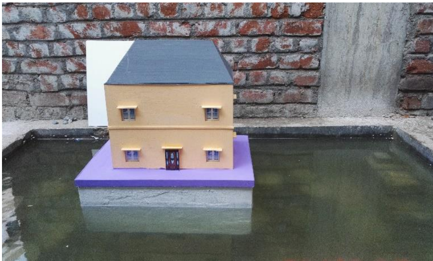
Fig: 8.5.3 Floating structure.

In the above figure 8.5.2 the three lines shows the distance from the bottom that is 20cm, 22.5cm & 25cm respectively. Hence the structure sinks according to the designed and calculated depth.