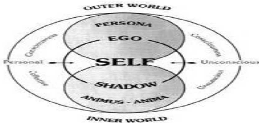
Figure 5: Jung's Model of the Psyche.

Robert Bly says that shadow in fact is the hidden part of the personality. He compares the shadow with the bag that contains undesirable things. He expounds that everybody has a bag in which he keeps on putting the things disliked by the society and the parents. As he grows in age, the size of the bag increases. Contrary to this, the well-liked side of the personality that is persona becomes nicer and nicer in the particular culture with the passage of time. Jung stresses that the persona is the mask that one wears to leave a definite impression on others and on the other hand to hide the true nature of his individuality. Roberte says that it is outward sense of the self.