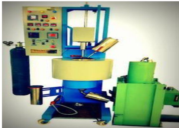
Fig 1 : stir casting equipment.

temperature of 250°C to remove moisture, and the die was pre heated to a temperature of 300°C. Then the Boron Carbide and Micro Titanium powders were mixed in into the molten metal. The crucible was covered with flux and degassing agents to improve the quality of Aluminium composite casting. The mixture was stirred continuously by using mechanical stirrer for about 10-15 minutes at an impeller speed 300 rpm. The melt temperature was maintained at 730°C during addition of the particles. The molten metal was then poured into the preheated die to cast plates.