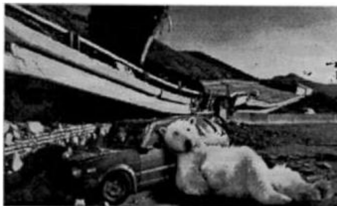
Figure 3: After Applying filter. [1]