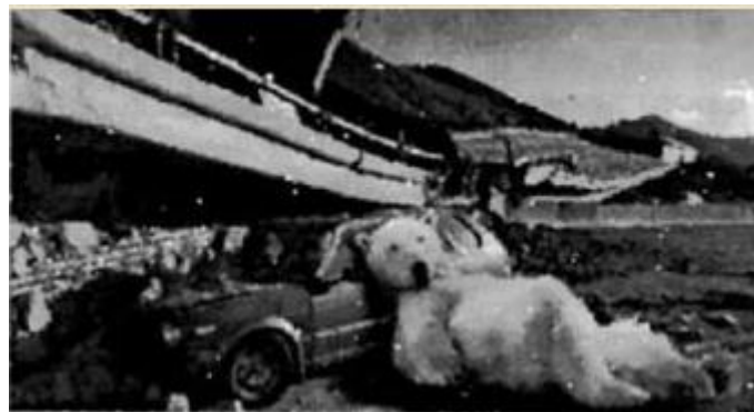
Figure 2: Before applying filter. [1]