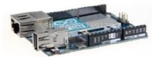
Fir: 3: Ardiuno Yun.

1. The Arduino Yun: is a microcontroller board that has not only Input and Output pins but is also capable of being networked wirelessly or through an ethernet port. Initially the plan was to incorporate and use the networking capabilities to communicate with a python database hosted.