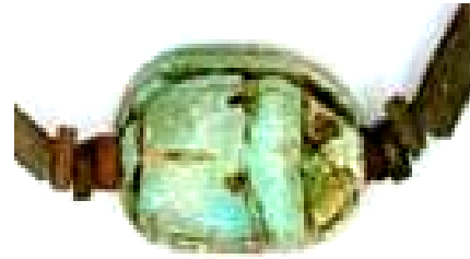
Fig.30: Scarab necklace from 26 th Dynasty. [42]