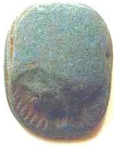
Fig.29: Heart scarab from 26 th Dynasty. [41]