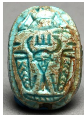
Fig.23: Seti II scarab from 19 th Dynasty. [33]