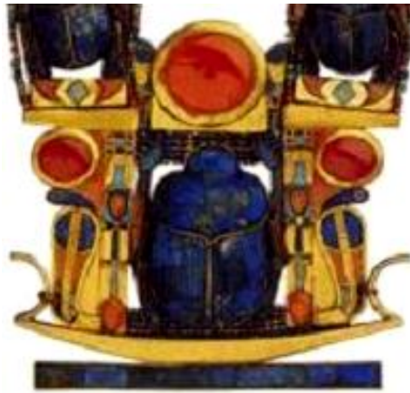
Fig.18: Scarab-necklace from 18 th Dynasty. [28]

comprised two (or three) scarabs and highly decorated with multi-colored patterns. Again, this product reflects the level of the high technology attained during this period.