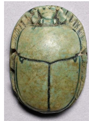
Fig.25: Scarab amulet from 21 st -22 nd Dynasties. [36]