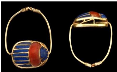
Fig. 3: Scarab-ring from 12 th Dynasty. [12]