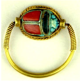
Fig.15: Scarab ring from 18 th Dynasty. [25]