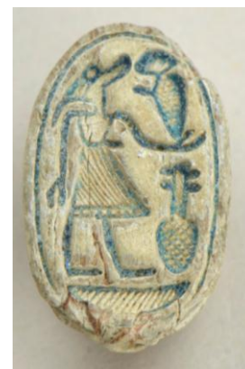
Fig. 9: Scarab-seal from 15 th Dynasty. [19]