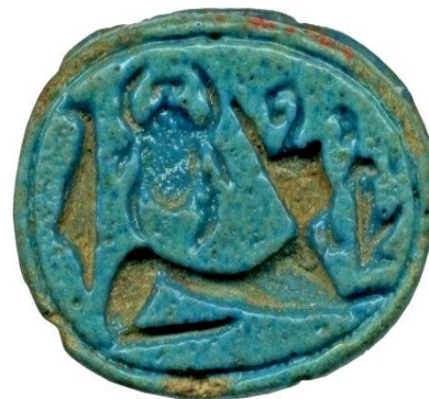
Fig.20: Scarab amulet from 18 th -19 th Dynasties. [30]