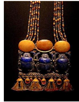
Fig.16: 3-scarab necklace from 18 th Dynasty. [26]