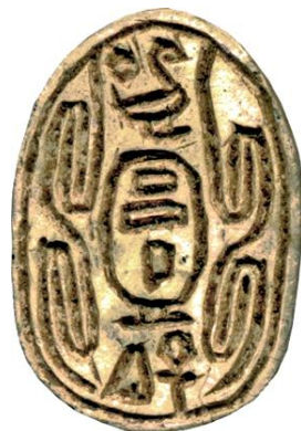
Fig. 5: Scarab-seal from 13 th Dynasty. [15]