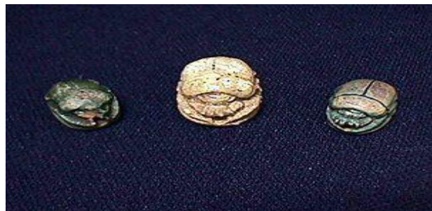
Fig.11: Scarab from 16 th Dynasty. [21]