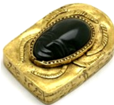
Fig.12: Heart scarab from 17 th Dynasty. [22]