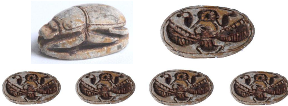
Fig. 7: Scarab-seal from 14 th -15 th Dynasties. [17]