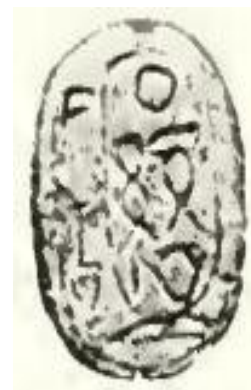
Fig. 6: Scarab-seal from 13 th Dynasty. [16]