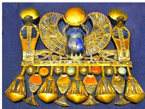
Fig.17: Winged-scarab from 18 th Dynasty. [27]