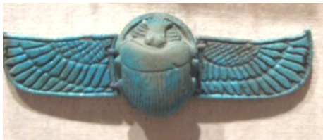
Fig.21: Winged-scarab from New Kingdom. [31]