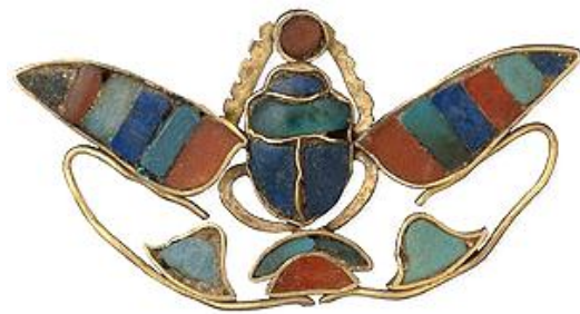
Fig. 4: Winged-scarab from 12 th Dynasty. [13]