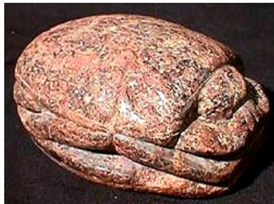
Fig.31: Heart scarab from 26 th Dynasty. [43]