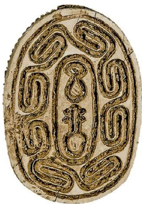
Fig. 8: Scarab-amulet from 2 nd IP. [18]