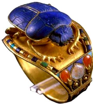
Fig.19: Scarab-bracelet from 18 th Dynasty. [29]