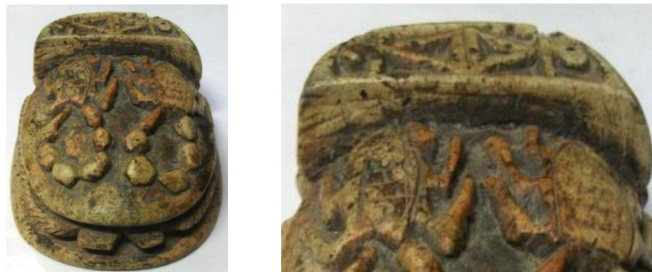
Fig. 2: King Narmer scarab from 1 st Dynasty. [11]

The available scarab model available is a 105 mm length limestone scarab belonging to Narmer, the first King of the 1 st Dynasty in display by ebay Co, UK for sale and shown in Fig.2. [11] The back of the scarab was decorated by two carved necklaces with scorpion amulets and another scenes on the scarab head.