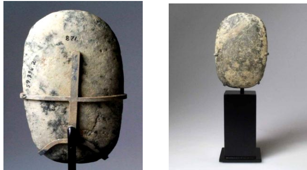
Fig. 1: Hand-crusher from Naqada II-III. [10]

the crusher without harming the hand while the crushing surface is completely flat having an ovoid shape.