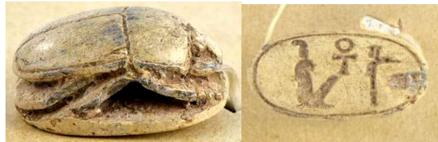
Fig.22: Ramses II scarab from 19 th Dynasty. [32]