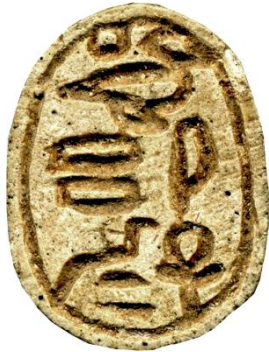
Fig.10: Scarab-seal from 15 th Dynasty. [20]