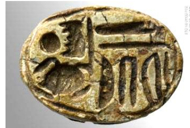
Fig.13: Heart scarab from 18 th Dynasty. [23] Fig.14: Royal Scarab from 18 th Dynasty. [24]