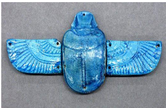
Fig.27 Winged scarab amulet from Late Period. [39]