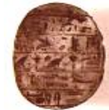
Fig.26: Scarab-seal from 21 st -22 nd Dynasties. [37]