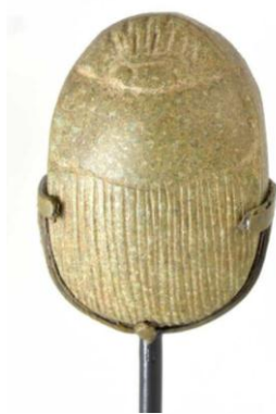
Fig.24: Heart scarab from 21 st Dynasty. [35]