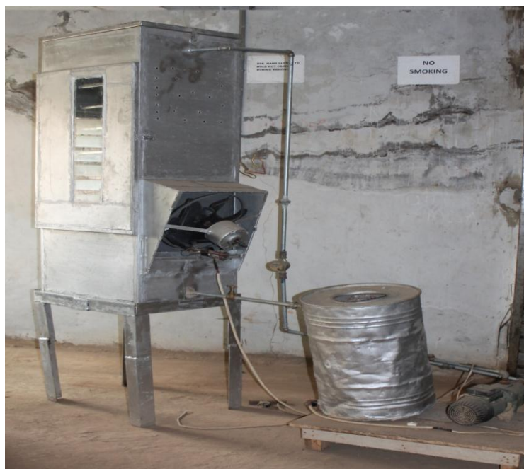
Plate 1: Pictorial view of Laboratory cooling tower model.

1=Plate cover, 2=Side frame, 3=Cooling chambers, 4= Cooling chamber stand, 5= Head cover, 6=Angular Support, 7=Fan shield, 8=Fan, 9=Steel hose, 10=Pressure gauge, 11=Water tank, 12 =Pipe Support, 13=Tank stand, 14=Valve, 15=Valve.