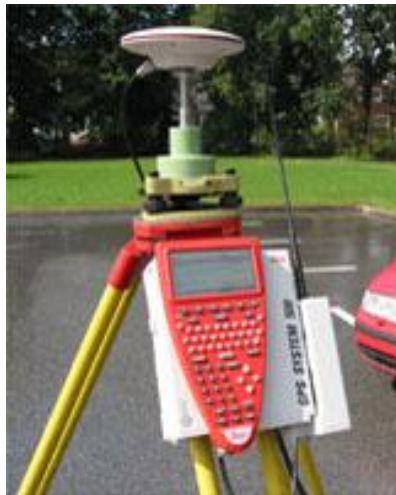
Fig. 6: Leica 500 GPS

The Global Positioning System (GPS) is a space based radio navigation system that provides geolocation and time information to a GPS receiver anywhere on or near the Earth Surface where there is an unobstructed line of sight to four or more GPS satellites. The GPS used in this test is Leica 500 (Figure 6). The main components of System 500 are the AT502 dual frequency antenna and SR530 Receiver. Ancillary components are the Terminal, Batteries, PC Cards and cables.