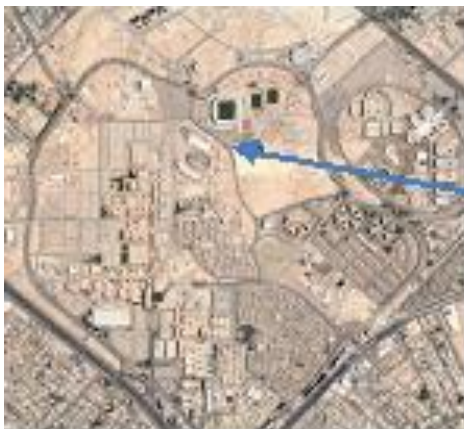
Fig. 2a: King Saud University Campus.

The site test is an area within King Saud University (KSU) which falls in the north part of the city of Riyadh, the capital of KSA. (Figures. 2a and 2b).