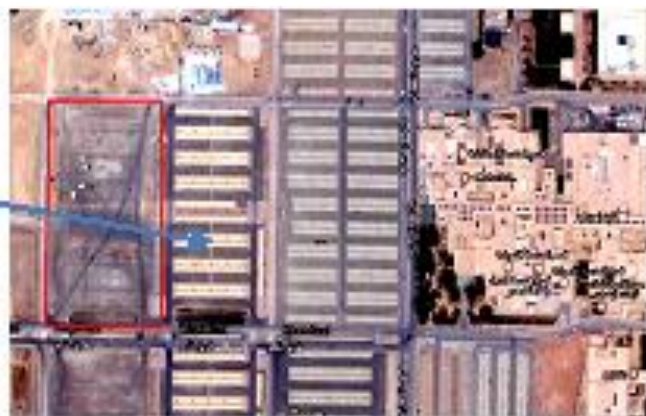
Fig. 2b: Test Area bounded by red line.

Figure 3 shows the selected nine points traverse connected with traverse lines. The site is a clear open space with few neighboring buildings.