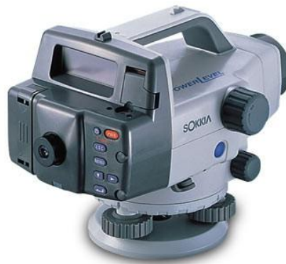
Fig. 4: Sokkia SDL 30 Digital Level.

The differential level used in this project to provide the height of points of control network is the digital Sokkia SDL30, with Fiberglass RAB-Code Staff, of accuracy claimed to be \pm 1\text{mm} for 1 km double run levelling (Figure 4).