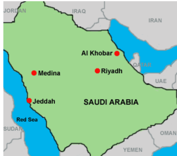
Fig. 1: Saudi Arabia Map and Riyadh Location.

Geographic information of Riyadh city are given in table 1 below: