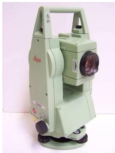
Fig. 5: Leica TC407 Total Station.

In this project, Total Station Leica TC 407 (Figure 5) with distance accuracy of 2\text{mm} \pm 2\text{ppm} and angular accuracy of 7'' available in the civil engineering department surveying laboratory, KSU has been selected to be used in height accuracy test.