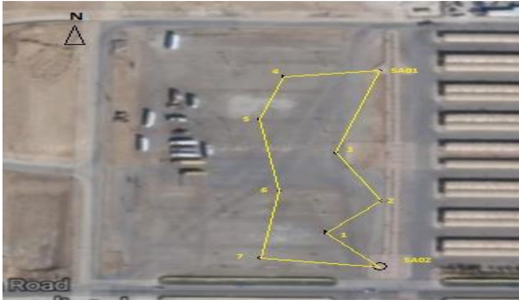
Fig. 3: Test Site and Control Traverse.