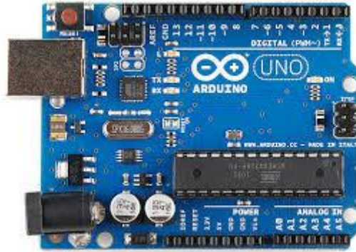
Figure 2: Arduino UNO Board.

Arduino is an open-source electronics prototyping platform based on flexible, simple to use hardware and software. It's proposed for artists, designers, hobbyists, and anyone interested in creating interactive objects or environments. In simple terms, the Arduino is a small computer system that can be programmed with instructions to interact with different forms of input and output. The current Arduino board model, the UNO, is small in size compared to the average human hand. It has 6 analog and 14 digital IO pins. It operates with 5v power supply, which is connected from either USB port or External power supply. It can function between 5V-20V. It has ATmega328 micro controller. This microcontroller has many features. It has 32KB of flash memory, 4 KB of which are used for the Boot loader, 8 KB SRAM and 4 KB EEPROM as shown in Figure 2.