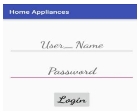
Fig. 3.1: Login page.

The Arduino Board is interfaced with the Relay in order to control the Appliances such as Light, Fan, AC, Etc. Here the Relay acts as a Switch. Since the Appliances are controlled wirelessly, the Arduino should be connected to the Internet. In order to connect the Arduino to the Internet, Arduino Ethernet Shield is used. The Arduino Ethernet Shield should be placed above the Arduino as shown in fig.2.4. The Appliances are controlled using the Application which is installed in the Android Mobile. At first the Android Mobile is connected with the Wifi in the Home Network. Since the Arduino is now connected to the Internet using Ethernet Shield. The Appliances can be controlled by the Android app through Internet. Here the Arduino acts as a Server and Android App is the Client. Thus by sending the command from the Android app it can control the Appliances in the Home. In this Proposed system the Appliances are controlled using Android Mobile through Wi-Fi. This system uses High Security. In order to control the Appliances the User needs to Login to the Android App using User_name and Password. User_name and Password are User defined. Figure.3.1. Shows the login page of the developed Android app. ., Korkmaz I., (2013).