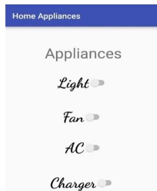
Fig. 3.3: List of Appliances in the Room.

By entering into the specific room the Appliances in that room are controlled. (Javale D).,Buttons are used to denote the rooms in Home. By clicking the Specific Room, the Appliances in that room will appear. The window showing the Appliances in a Specific room shown in fig.3.3.