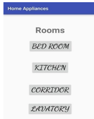
Fig. 3.2: Customized list of Rooms.

By entering into the specific room the Appliances in that room are controlled. (Javale D).,Buttons are used to denote the rooms in Home. By clicking the Specific Room, the Appliances in that room will appear. The window showing the Appliances in a Specific room shown in fig.3.3.