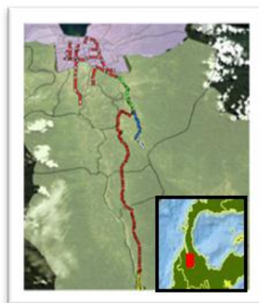
Figure 3: Map of the Pasigala Regional SPAM.

The location of the research was carried out at the construction of the Pasigala Regional Drinking Water Supply System (SPAM), Central Sulawesi Province. Where the project is built along 42.18 km. Research time starts in October 2020.