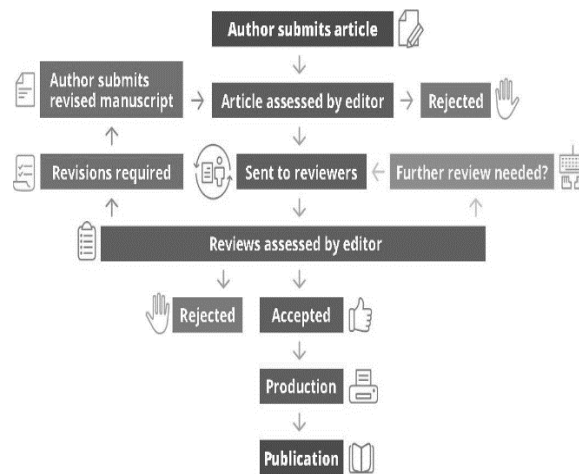
Fig. 2: Peer review process (After Wiley).