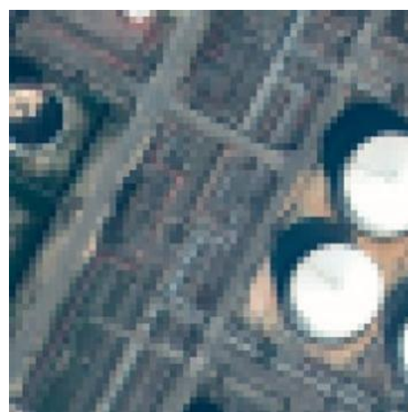
Figure 2: Oil Refinery Taranto ( www.euspaceimaging.com/true-30-cm-imagery/ ).

The optical images (photo images) to be used for mapping, therefore should have ground sampling distance (GSD) or GSR no larger than 0.5m which is satisfied by what is called Very High Resolution Satellites (VHRS).