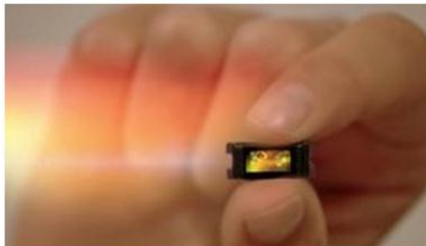
Figure 2: An image of a laser.