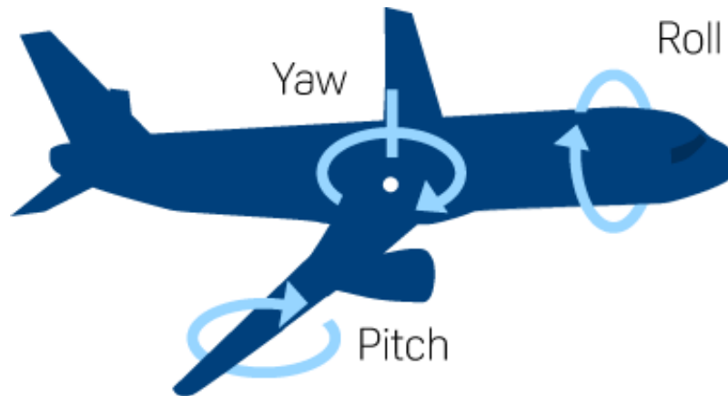
Figure 4: The variations in a plane.