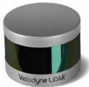
Figure 3: Example of a Velodyne lidar system.

In this the total is divided by 2 because the amount of time taken is the time taken for the pulse and return both. But we need the time for only the return.