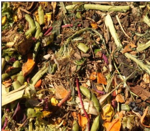
Figure 3.1: Fresh Household waste.