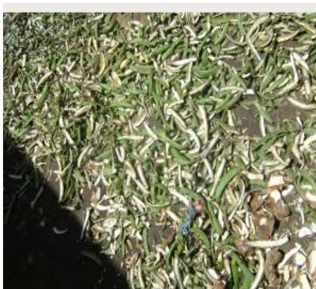
Figure 3.2: Sun dried household waste.

Household wastes are dried by solar ray to reduce its moisture content and it takes about two to three days for those wastes to be dried, the experiment was 10kgs of fresh wastes and it gives around 6 Kgs of dry wastes.