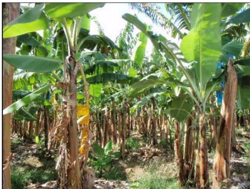
Figure 1.1: Banana plantation in Rukira sector (Ngoma district).

The proportions of banana types are: 45% beer type; 45% cooking type; and 10% dessert type. Banana production in Rwanda averages at about 2.5 million metric tons per year. The crop is grown on about 165,000 ha and occupies 23% of all arable land in the country (Seasonal Agricultural Survey reports (SAS), NISR). Banana plantation in Ngoma district occupies 80% of agriculture activities and around 65% of all arable land in District is occupied by banana plantation.