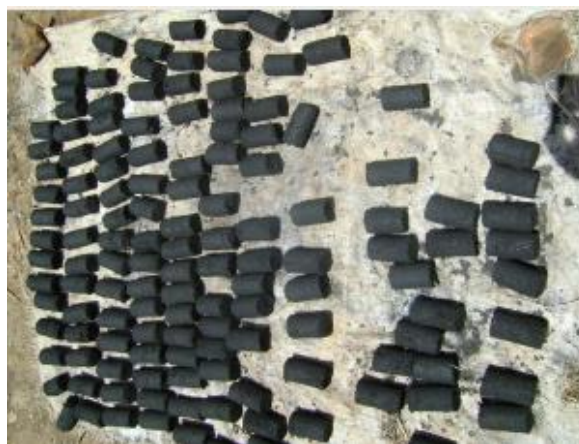
Figure 3.6: Produced briquettes.

The calorific or heating value is an important indicator of the quality of the pressed fuel briquettes. It measures the energy content of the briquettes. It is defined as the amount of heat evolved when a pressed fuel briquette is completely burnt and the combustion products are cooled. And the Gross Calorific Value, shortened as GCV, refers to the calorific value with the condensation of water in the latent heat, also known as higher heating value. Whereas during combustion, the heat of condensation of the water contained in the fuel and formed during combustion will become unavailable because the vaporization of the water. And then, the useful heating value is gained after the heat of condensation of the water being subtracted from the gross calorific value, which is referred as the Net Heating Value or lower heating value.