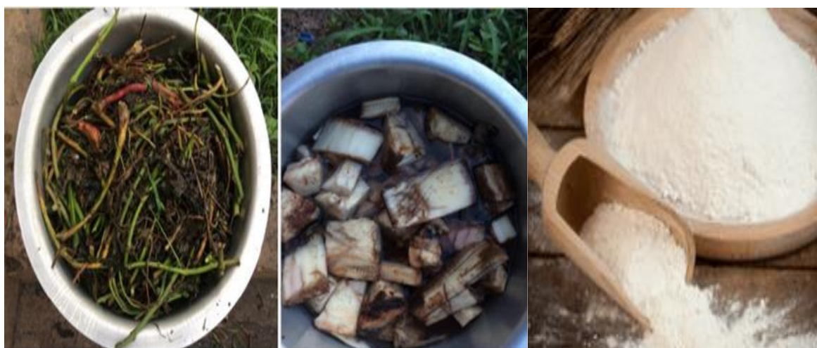
Figure 3.4: Sweet potato stems, Banana stem and Cassava flour.

For this experiment natural binders which include; - sweet potato stems sap, banana stem pulp and cassava flour has been used.