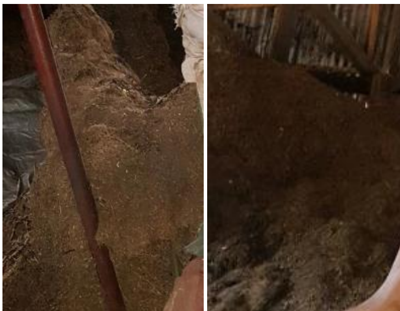
Figure 3.5: Mixed dried waste.

Smashing the dried wastes into powder was done by the dried wastes mixed with water and put into compressing machine.