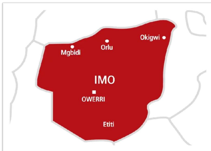
Figure 2: Map of Imo State.