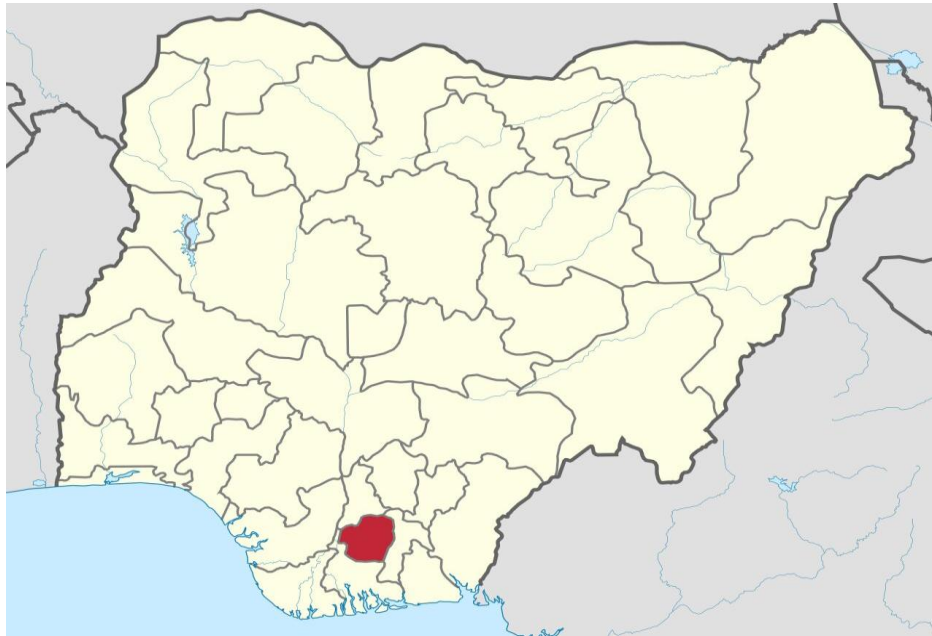
Figure 1: Map of Nigeria showing Imo State.

4.8 million people (Imo State - Wikipedia 2021). Natural resources in the state include zinc, lead, crude oil, natural gas, and some economic flora.