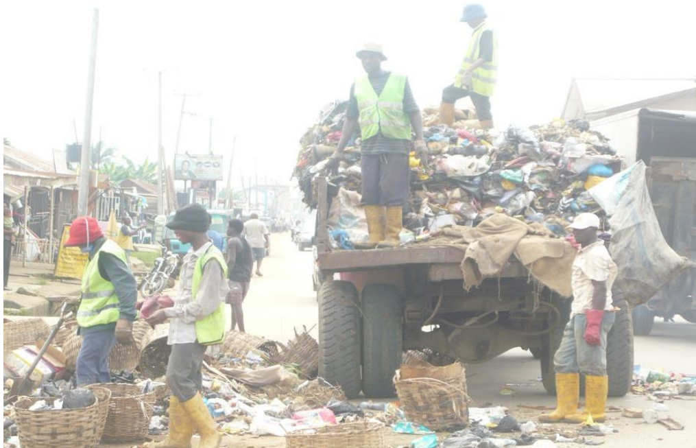
Plate III: Waste evacuation along Ikwerre road.

Waste at the dumped site is left exposed on land without treatment which enters the rivers during rain through surface runoff and results in water pollution and danger to aquatic life.