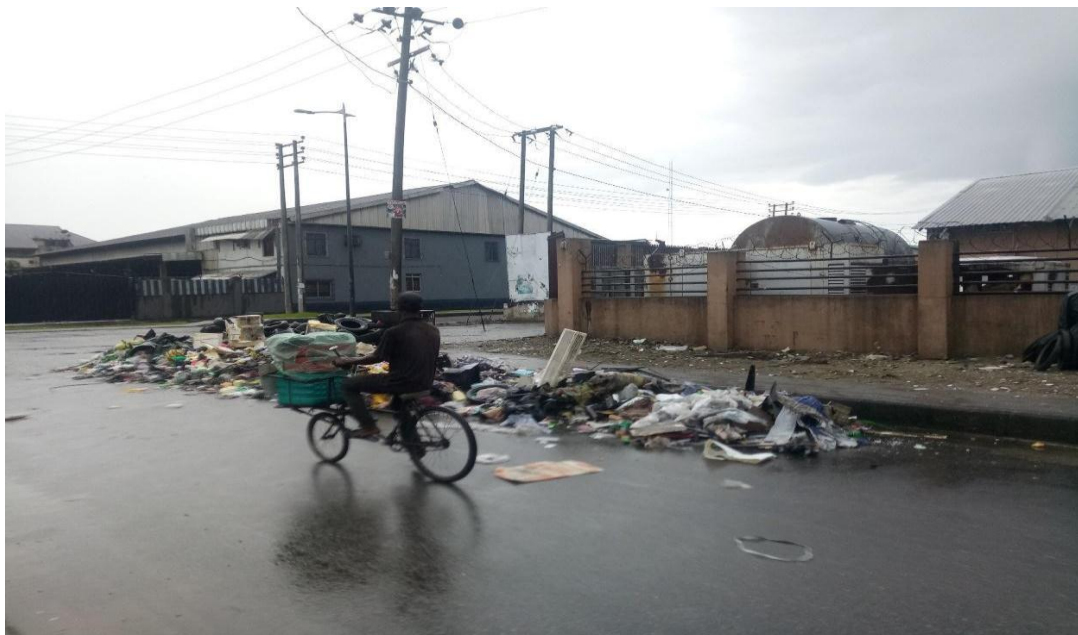
Figure I: Waste dumped by a street corner in D/Line, Port Harcourt, 2019.