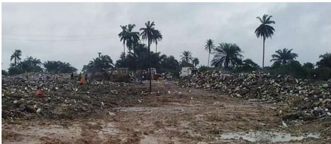
Plate IV: Dumpsite at Iwofe waterside area.