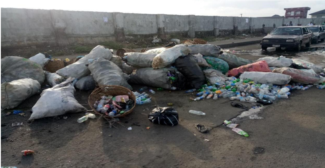
Plate II: RIWAMA approved dumpsite, Mile 3, Diobu.

proper sorting and exposed to the environment.