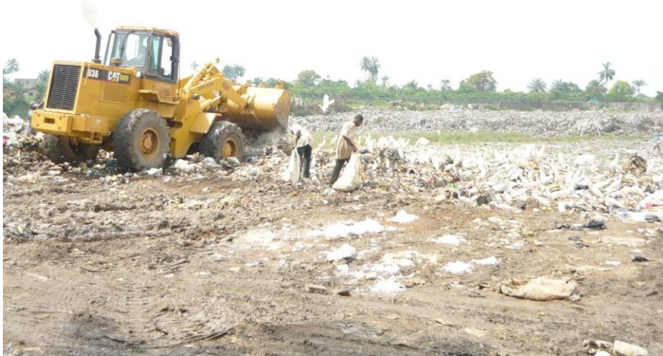
Figure II: Bulldozers and scavengers at work at the Elioizu dumpsite, Port Harcourt.