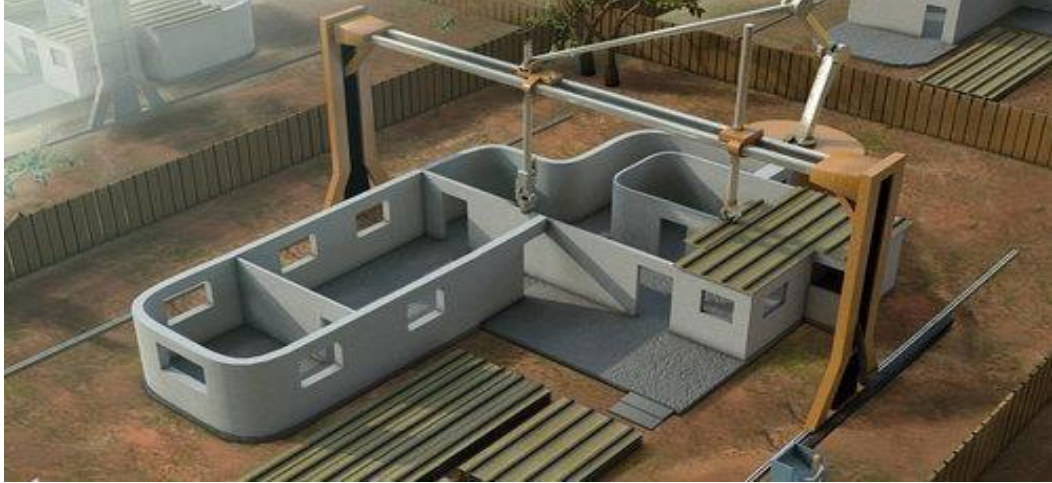
Figure 2: 3D Concrete Gantry Printer.

each other with motorized wheels which move the steel frame in linear direction. The size of gantry printers differs from small laboratory version to a large version of dimension 40m x 10m x 6.6m.