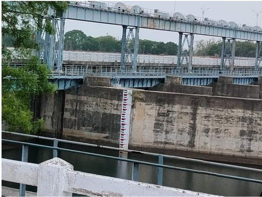
Figure 2: (Rudri Barrage, (District, Dhamtari)).

contextual information for analysing reservoir level changes and their impact on the surrounding environment.