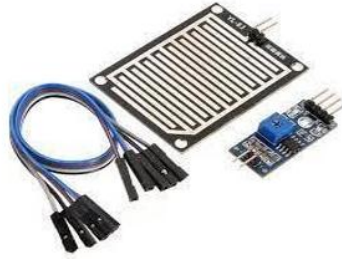
Fig. 2.4: Rain Sensor.