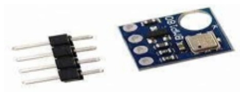
FIG. 2.2: Barometric 180 Sensor.