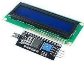
FIG. 2.5: LCD.

LCDs consume much less power than LED and gas- display displays because they work on the principle of blocking light rather than emitting it. Where an LED emits light, the liquid crystals in an LCD produce an image using a backlight. As LCDs have replaced older display technologies, LCDs have begun being replaced by new display technologies such as OLEDs.