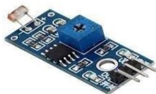
Fig. 2.1: Photo resistor sensor.

camera light meters, and environmental detecting process. When integrated into a system such as a climate detecting setup done with NodeMCU ESP8266, these detector serves as a valuable component for light intensity detection. Through a connection to a certain one of NodeMCU's analog pins, the LDR, in conjunction with a fixed resistor and a voltage divider circuit, allows the microcontroller to obtain analog values that reflect the ambient light conditions. The acquired data can then be interpreted to discern day and night cycles, estimate cloud cover, or measure sunlight intensity. While programming, developers read analog values from the connected pin and utilized the obtained information to make informed decisions built on prevailing light conditions. In the realm of weather monitoring, these detector contributes to a more comprehensive deal of the environment, offering insights into diurnal patterns and potential correlations between light levels and atmospheric conditions. However, it's crucial to consider factors such as response time and calibration to ensure accurate and reliable readings, particularly in dynamic outdoor environments where lighting conditions can vary widely. Overall, the phot resistor detector emerges as a versatile and accessible tool for enhancing the capabilities of NodeMCU ESP8266-based projects, providing a cost-effective solution for light-dependent applications in diverse fields.